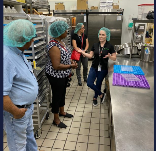
On June 16, Board Members from the CCB visited Evergreen Organix, a licensed cultivation and production facility in Las Vegas.

Reminder: Due to COVID-19, the expiration date of all temporary agent registration cards and temporary delivery vehicle identification cards has been extended to June 30, 2021 . Read more, here .